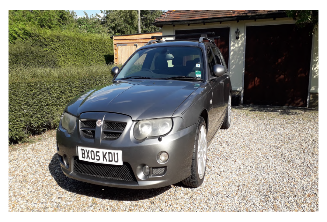
The 200,00 mile ZT-T

MG Car Club South east centre web site – <a href="http://www.mgccse.co.uk">http://www.mgccse.co.uk</a> Register Office: Kimber house,PO Box 251, Abingdon, Oxfordshire, OX14 1FF Phone: 01235 555552, Fax: 01235 533755, email: mgcc@mgcc.co.uk