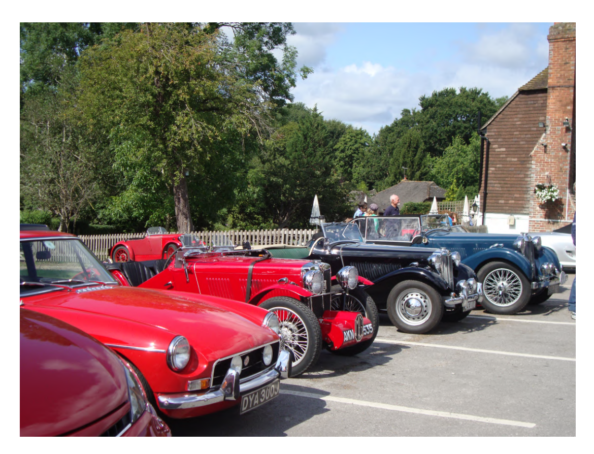
SW at the July event