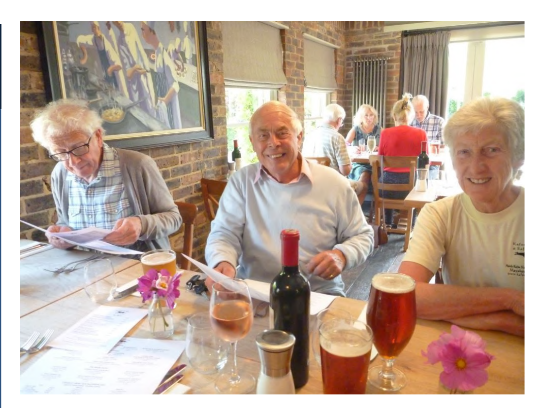
AA August and September meets