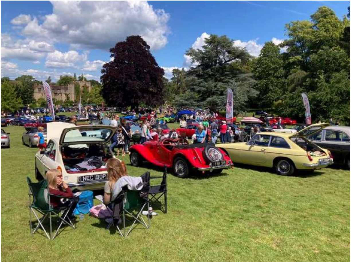
The very rare 1929 MG Mark 111 18/100 "Tigress" – 5 made; 2 Remaining & ONLY 1 on road!

Cars at the Castle, which 32 of our MG's attended on Sunday June 16th A great success and the weather wasn't bad either.