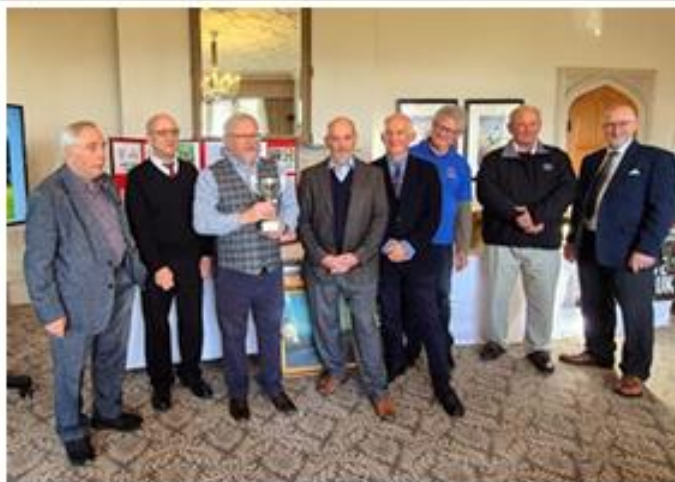
MGSE Significant Contribution Trophy awarded to: