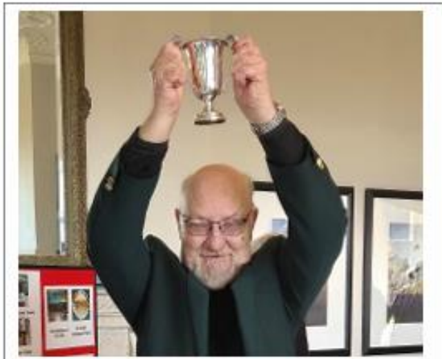
The Carrisma Cup for the person best representing the “spirit” of the MG Car Club SE