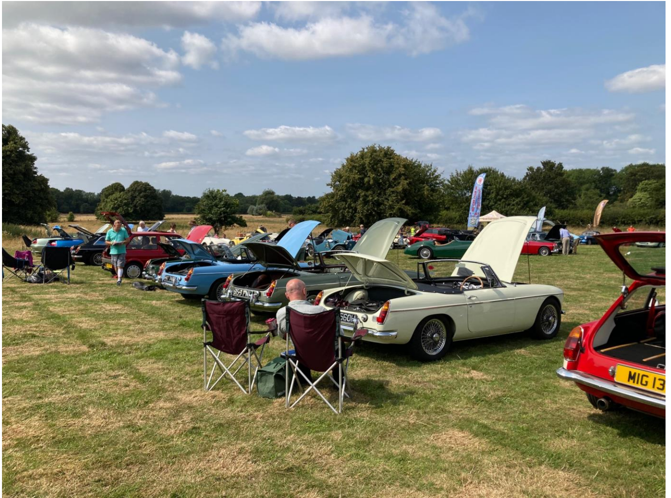
West Horsley Place..