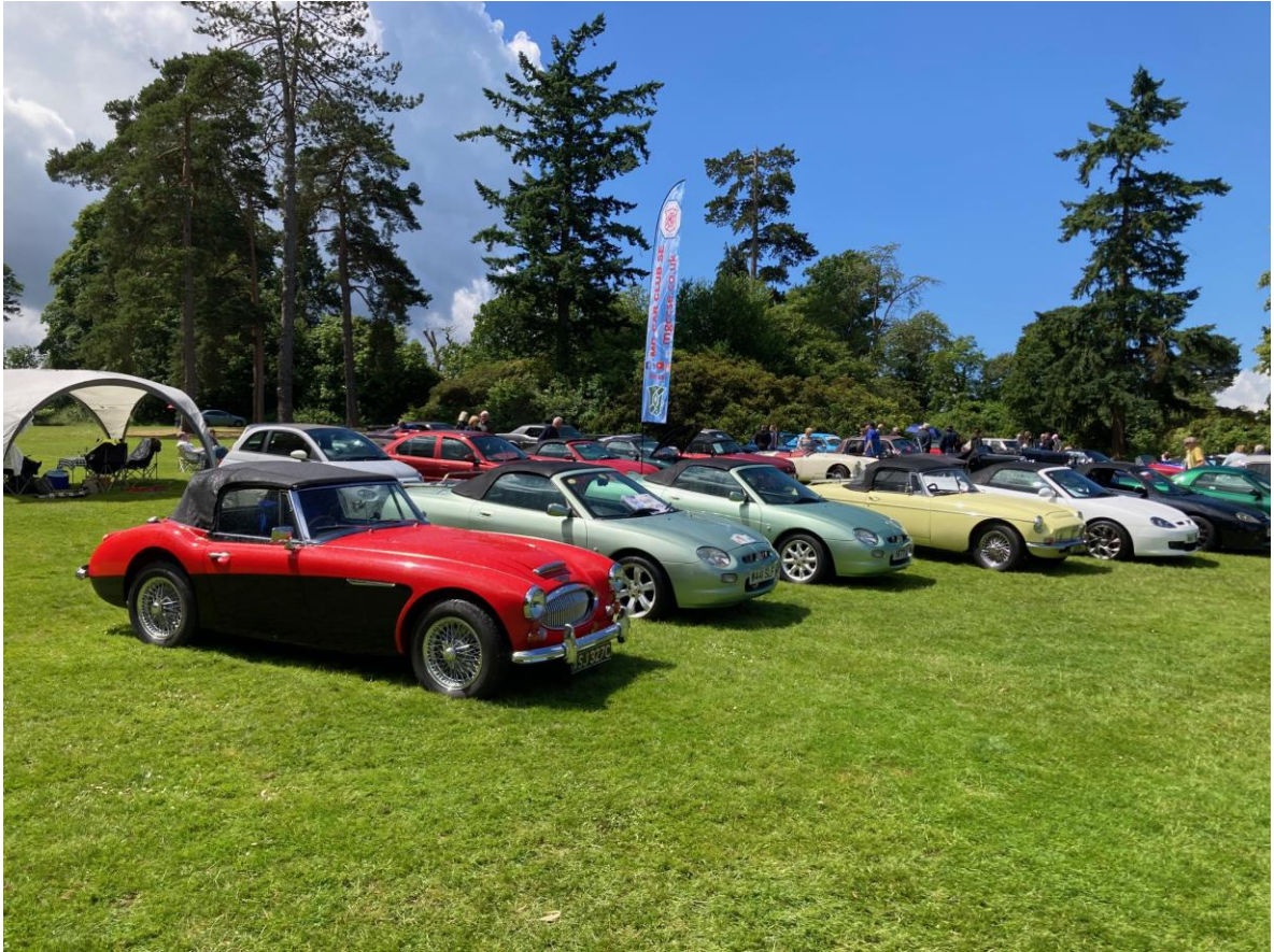
Other Classics at Hever :-