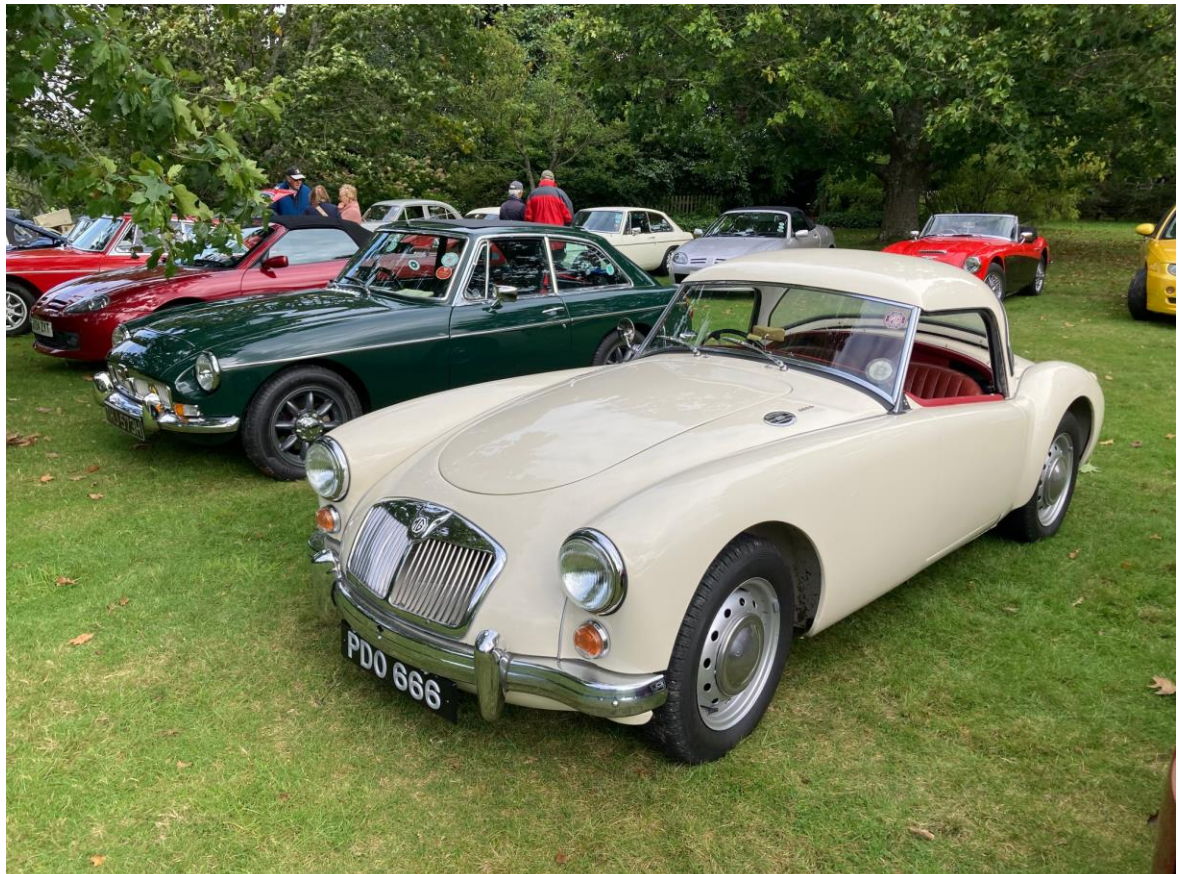
Borde Hill :- And,below, Roy Gooderhams 1960 totally original MGA (complete with rare factory hand-top)...which he's owned for 60 years!